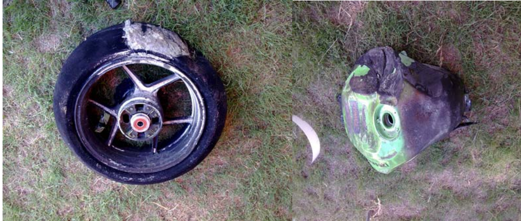
A spare tyre and fried tank for anyone??