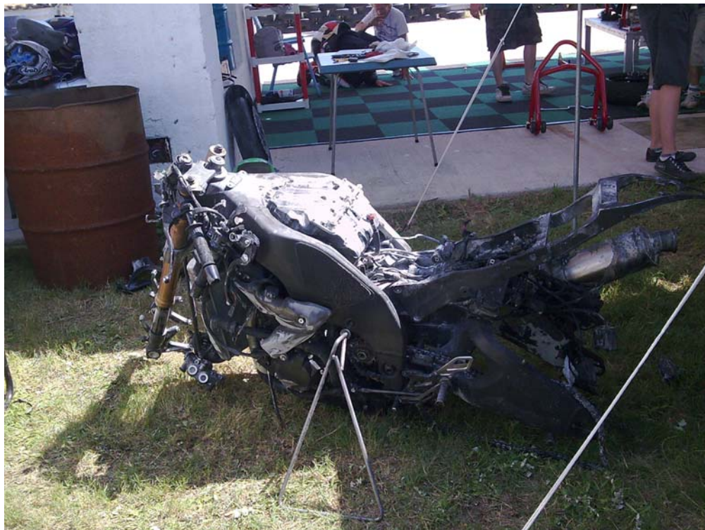
One slightly used ZX10 used by old lady to church on Sundays only

You be the judge of the following pictures: