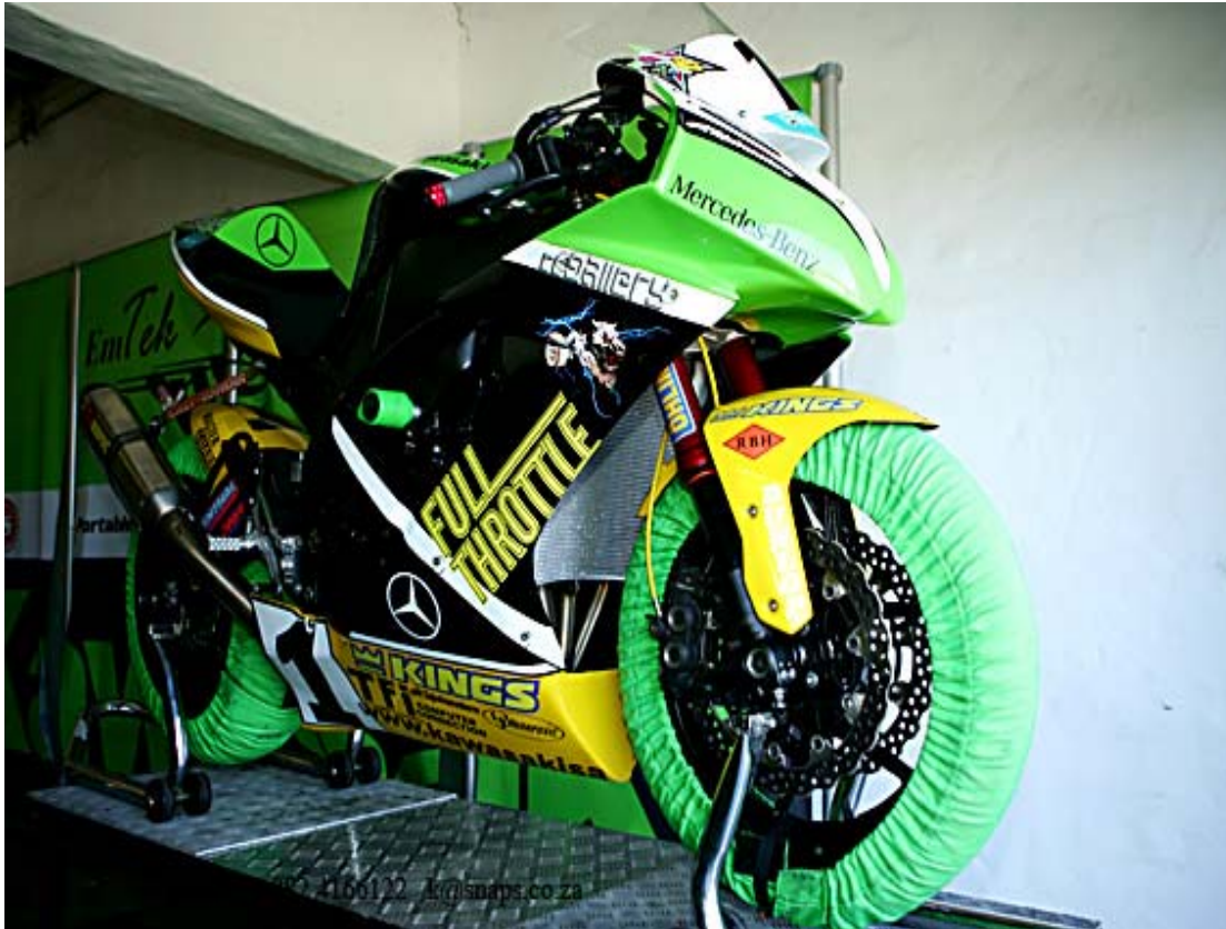
EmTek Racing pit setup –Shez's bike in the shabby pit # 2

We were blessed however with good weather for a change except for the traditional wind that is notorious in PE.